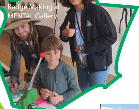
Badge Making at MENTAL Gallery